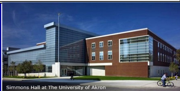
Simmons Hall at The University of Akron

Fall & Spring Office Hours: Monday- Friday 8 a.m.-5 p.m.